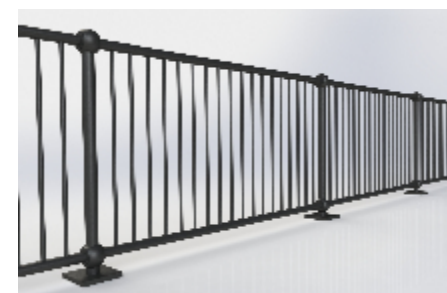
Shown powder coated