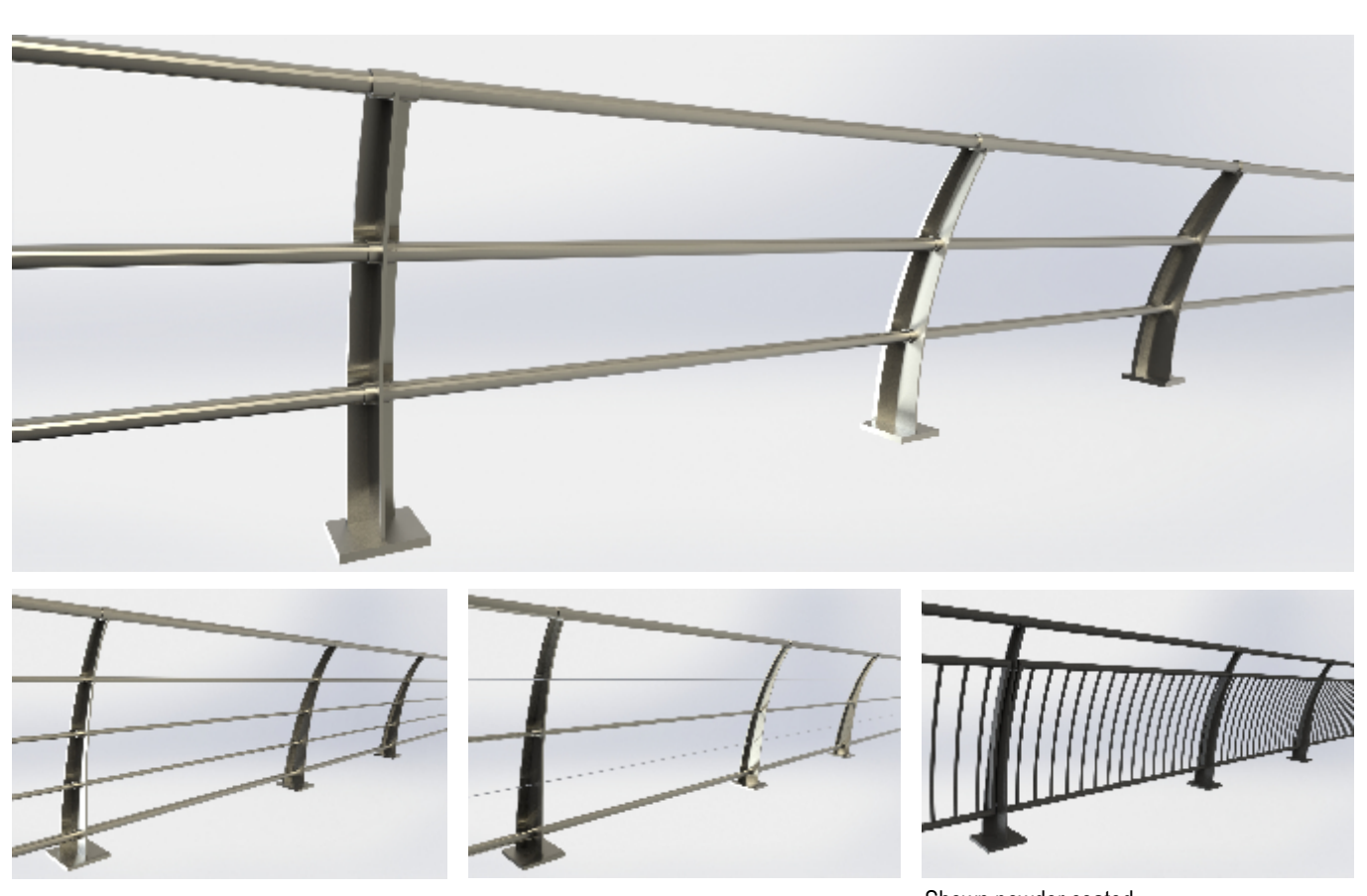
Shown powder coated

www.asfco.co.uk info@asfco.co.uk 01484 401414